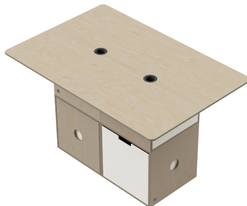
ACTIVE Table top rectangle 120x80

PRODUCT RANGE 2 x ACTIVE Box 1 2 x ACTIVE Box 285 2 x ACTIVE Foot Cross 3 x ACTIVE Connectors 2 x ACTIVE Metal Drawer 2 x ACTIVE Metal Drawer 285 1 x ACTIVE Table Tops Variant