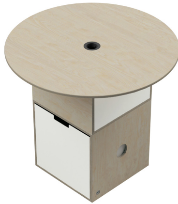
ACTIVE Table top circle Ø80