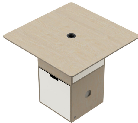
ACTIVE Table top square 80x80

PRODUCT RANGE 1 x ACTIVE Box 1 1 x ACTIVE Box 285 1 x ACTIVE Base 3 x ACTIVE Connectors 1 x ACTIVE Metal Drawer 1 x ACTIVE Metal Drawer 285 1 x ACTIVE Table Tops Variant