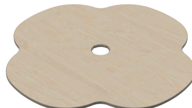
ACTIVE Table top flower Ø80