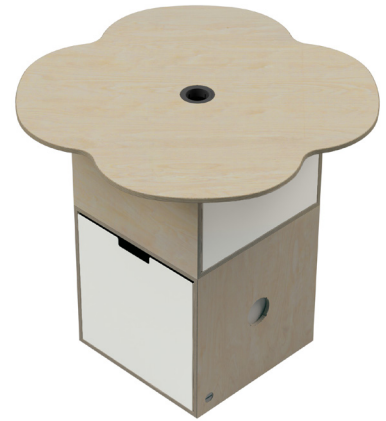
ACTIVE Table top flower Ø80