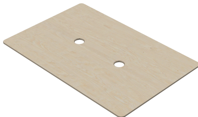
ACTIVE Table top rectangle 120x80