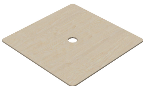
ACTIVE Table top square 80x80