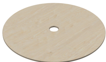
ACTIVE Table top circle Ø80